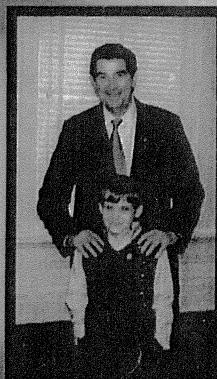
Governor Bob Riley

To Sponsor a Leg or To Support C.F. Azalea Trail Run logon to www.caringnowforkids.org or stop by any Wachovia Bank location and ask how to give to caring now for kids fund. Or for more donation info call: 251.422.4555 or 251.623.3648 www.caringnowforkids.org